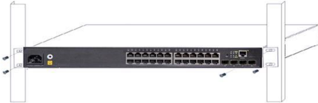
Fig 2-2 Fasten the Switch to the Rack

2. Put the bracket-mounted switch smoothly into a standard 19" rack. Fasten the switch to the rack with the screws provided. Leave enough space around the switch for good air circulation.