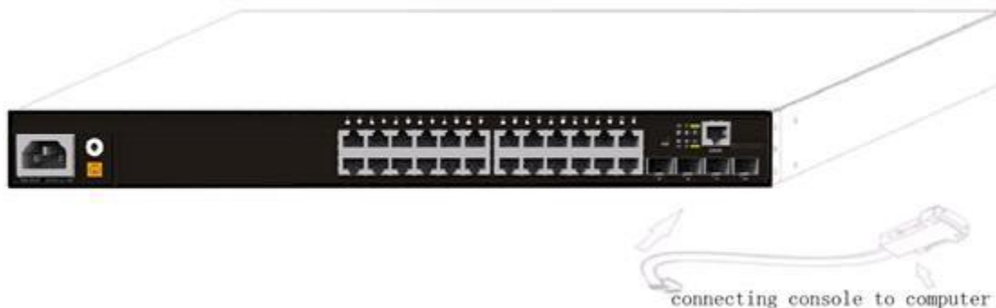
Fig 2-3 Connecting Console to switch

DG-GS4628E2/DG-GS4628HPE-P provide a RJ45 serial console port.