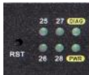
Fig 1-25 DG-GS4628E2 system LED diagram