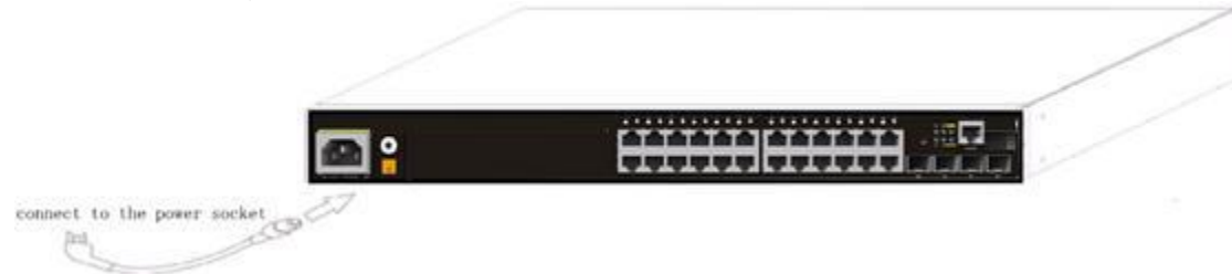
Fig 2-4 Connecting power to switch

Power supply connection procedure is described as below: