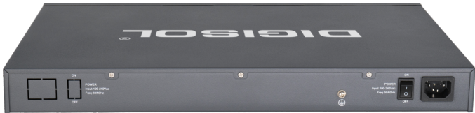
Rear View :

DG-GS2654FSE2: DIGISOL Ethernet Layer-3 lite switch with 48-Port Gigabit SFP + 6-Port 10G SFP+ (single AC-220V power supply, with cooling fan, 1U,standard 19-inch rack-mounted installation)